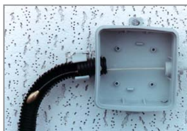
Problem-free: the spring ball leader adjusts even to narrow bends.