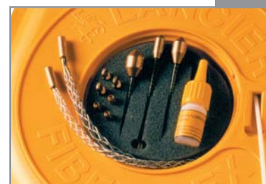
Handy: accessories are stored in the cassette's center compartment